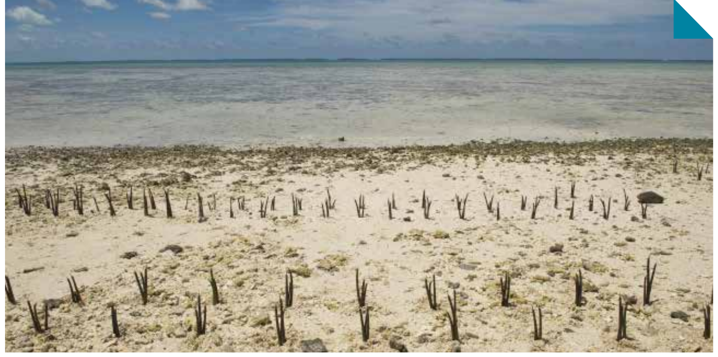
Mangrove shoots planted by UN Secretary-General Ban Ki-moon and others (Tarawa Atoll, Kiribati).

Perhaps because of such reasons, as a group, small island states are nearly 40 percent richer than other states.<sup>46</sup> For example, the only low-income country in the Caribbean is Haiti, one of the largest with a population of over 8 million; whereas there are two high-income SIDS in the region—Bahamas and Barbados.