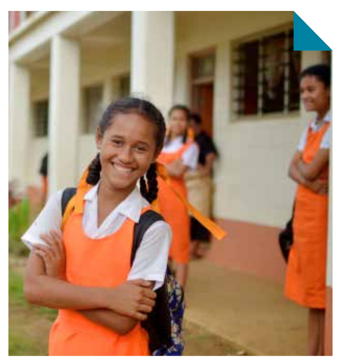
Life for students is set to change with the arrival of high-speed broadband internet in Tonga.

The challenges for SIDS are indeed complex and many.<sup>74</sup> Among other issues, they include: climate change, health, trade, science and technology, sustainable capacity development and education for sustainable development, knowledge management and information for decision-making, and culture. The struggle of many states to implement the Barbados Programme of Action (BPOA)<sup>75</sup> suggests that even in smaller country contexts, coping with complexity proves difficult.